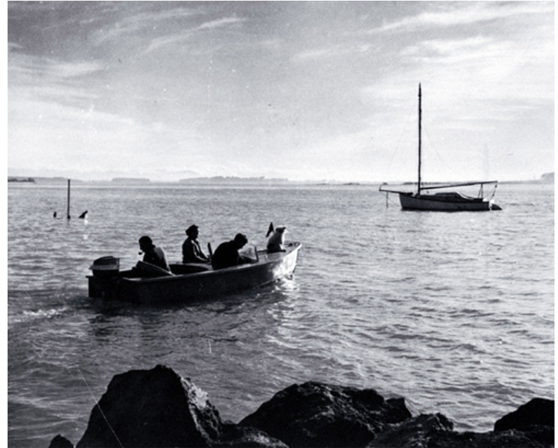
A motor boat approaches a moored yacht on the Estuary at Redcliffs. ca 1960. Flickr CCL-KPCD-11-032

Anything we think might interest our users.