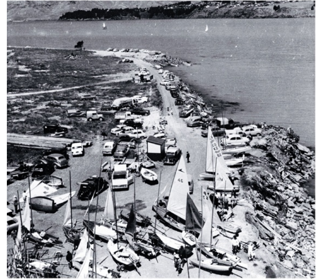
Area adjoining the Canterbury Yacht and Motor Boat Club's shed at Lyttelton during the second day of the regatta. Dec. 1964. Flickr CCL-KPCD-11-026