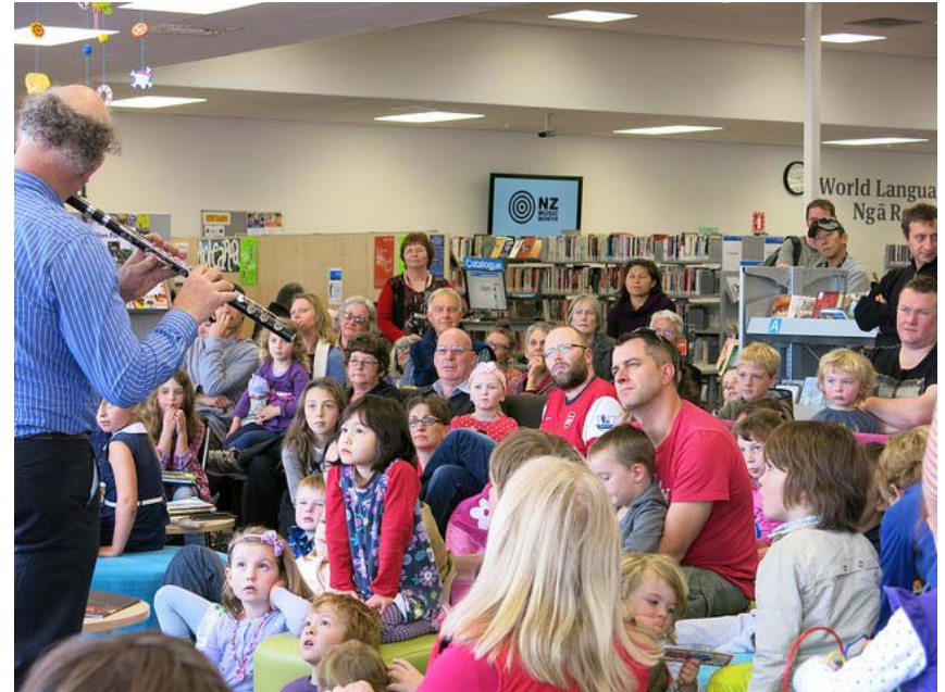
Christchurch Symphony Orchestra - NZ Music Month Central Library Peterborough.