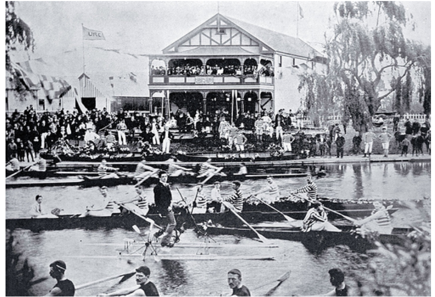
Regatta Day on the Avon, circa 1921.

Figure out how much resource and effort to spend.