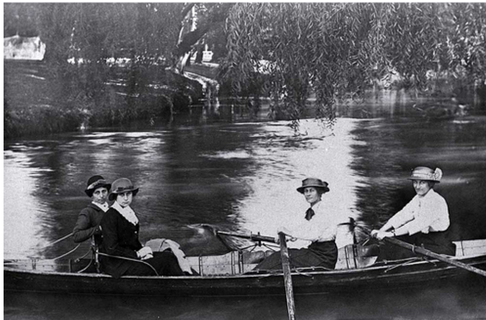
Women rowing on the Avon River, Christchurch 191-? Flickr CCL-KPCD-04-057

Taking website content on to blogs and social media