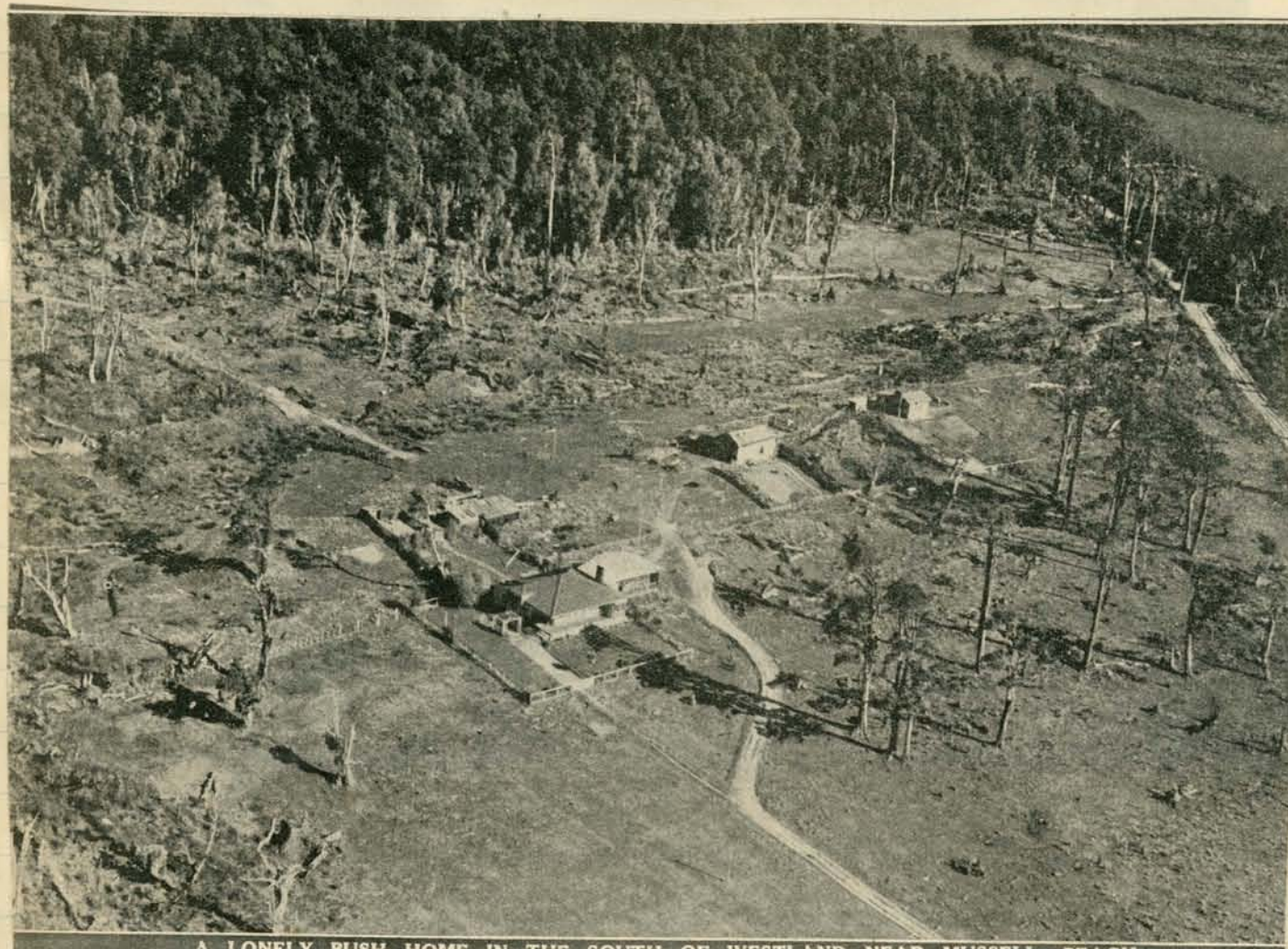
A LONELY BUSH HOME IN THE SOUTH OF WESTLAND NEAR MUSSELL BEACH