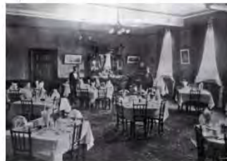
Early Christchurch Settlers