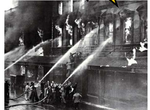
Rescuing Mr K. Ballantyne from the burning building on Colombo Street, Christchurch. [1947] File Reference CCL PhotoCD 1, IMG0018

These are suggested subjects only and others may be available on request. Content will vary depending on where the programme is delivered and may be tailored to suit your curriculum needs. Please contact us (see below) to discuss your requirements.