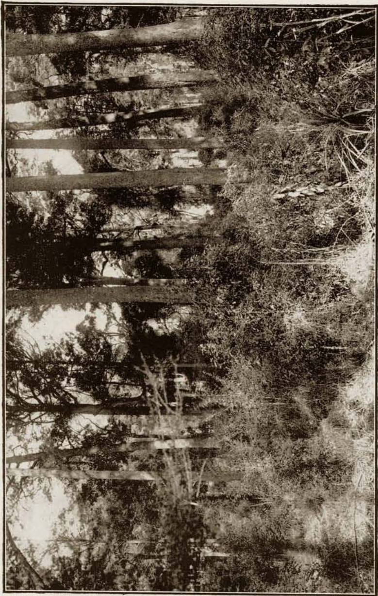
General view showing forest trees with growth of shrubs and juvenile forms in the foreground.