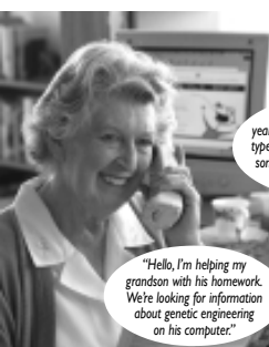
"Hello, I'm helping my grandson with his homework. We're looking for information about genetic engineering on his computer."

Christchurch City Libraries is just a phone call or computer click away... Phone 941 7923 or click http://library.christchurch.org.nz