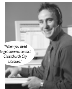
"When you need to get answers contact Christchurch City Libraries."