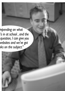
"Depending on what year he's in at school, and the type of question, I can give you some websites and we've got books on the subject."