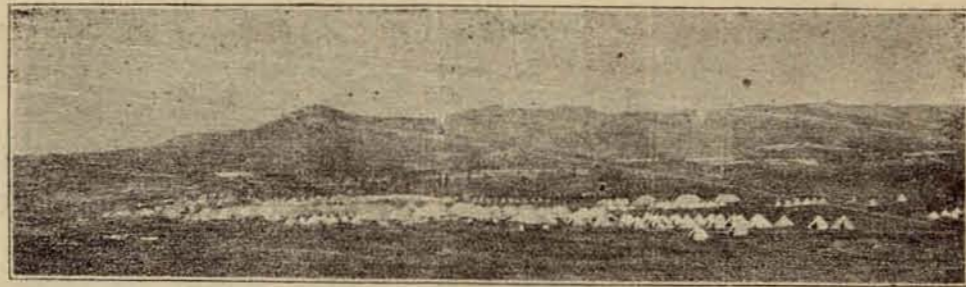
View of Lembet Camp, Salonika, showing our Hospital in the foreground.