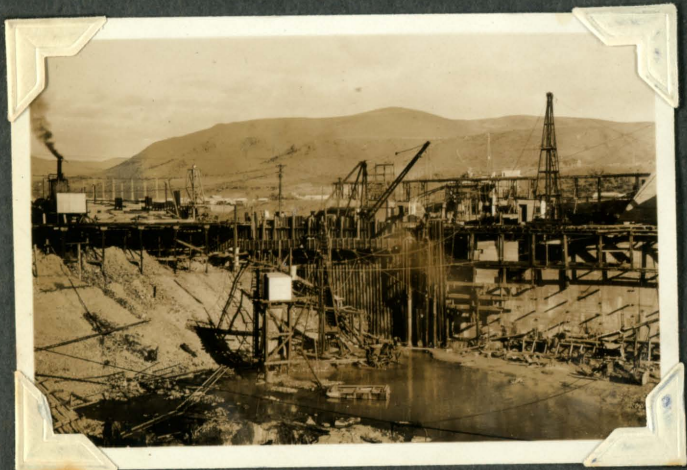
Excavation in Cofferdam Sheet piling partly removed. Outdoor station steel towers in background on left.