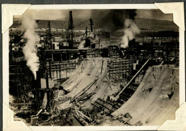
Steam driven auxiliary pumps being used to assist. in power shortage. Village in background.