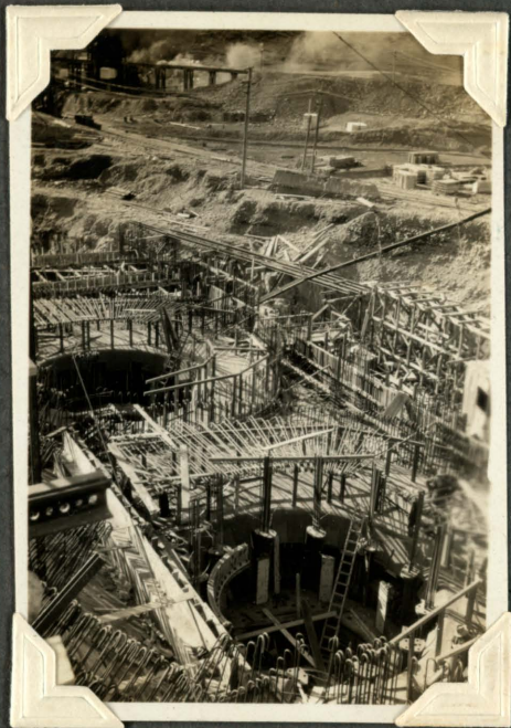
Looking down on Nos 1 + 2 turbine pits. Guide vanes in position.