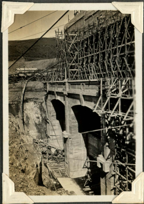
Tailrace discharge from N os 4 & 5 units.