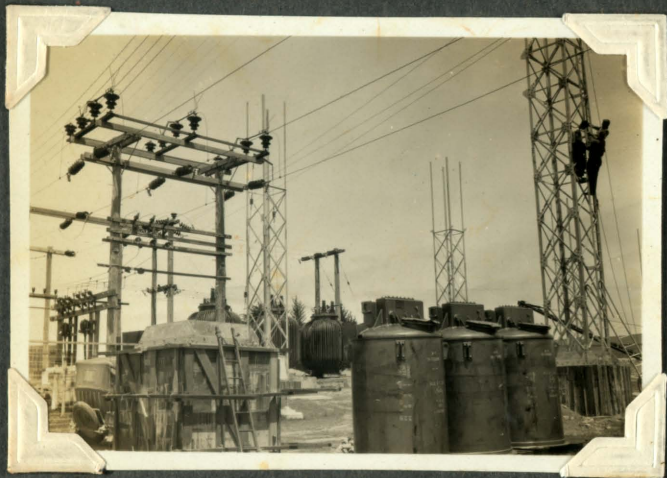
Main B.T.H. oil switches. in foreground.