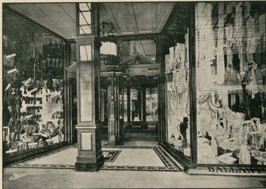
J. BALLANTYNE & COMPANY'S MAIN ENTRANCE.

SOLID SILVER AND SILVER PLATE. —Our establishment admittedly contains a choice of goods which both gladden and surprise every visitor. Whether viewed from the stand-points of Newness, Worth, Style, Finish, Workmanship or Good Value. Our wares in this department virtually challenge and set aside all competition, representing as they do the sovereignty of art by makers in the front rank of their craft.