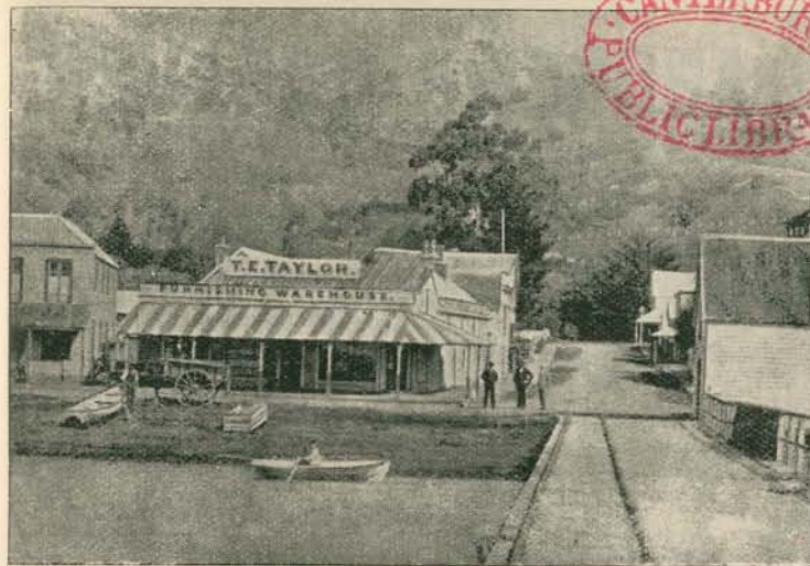
GROCERY AND GENERAL WAREHOUSE.