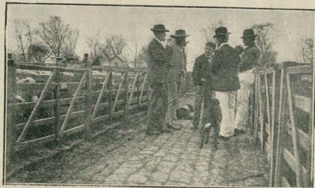
SOME WELL-KNOWN ATTENDANTS AT THE METROPOLITAN MARKET