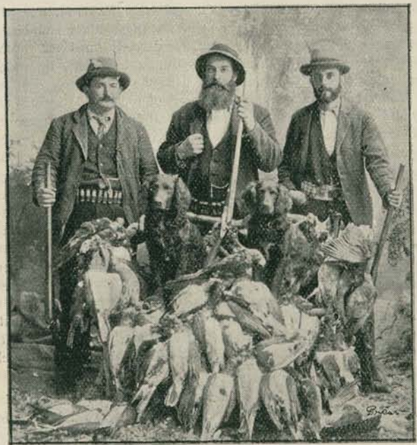
ONE DAY'S DUCK SHOOTING (80 BIRDS) IN CANTERBURY, NEW ZEALAND.