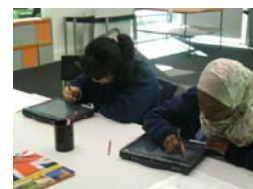
Students working on Tablets as part of ESOL Book Wizard Programme

Podcasting School, Design School, Numeracy Extension, E-Coach, Youth Heritage Competition, Music Composition using Sibelius – Advanced, Comic Book Creation.